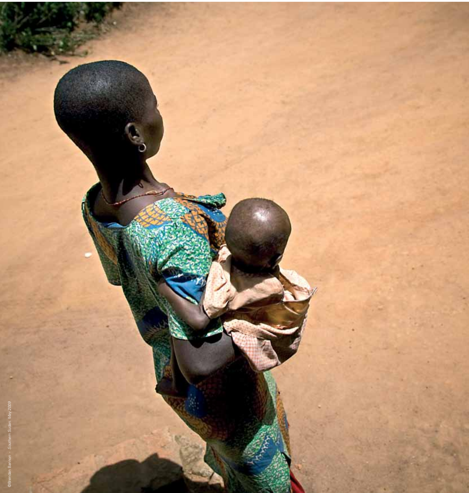
Southern Sudan, May 2009