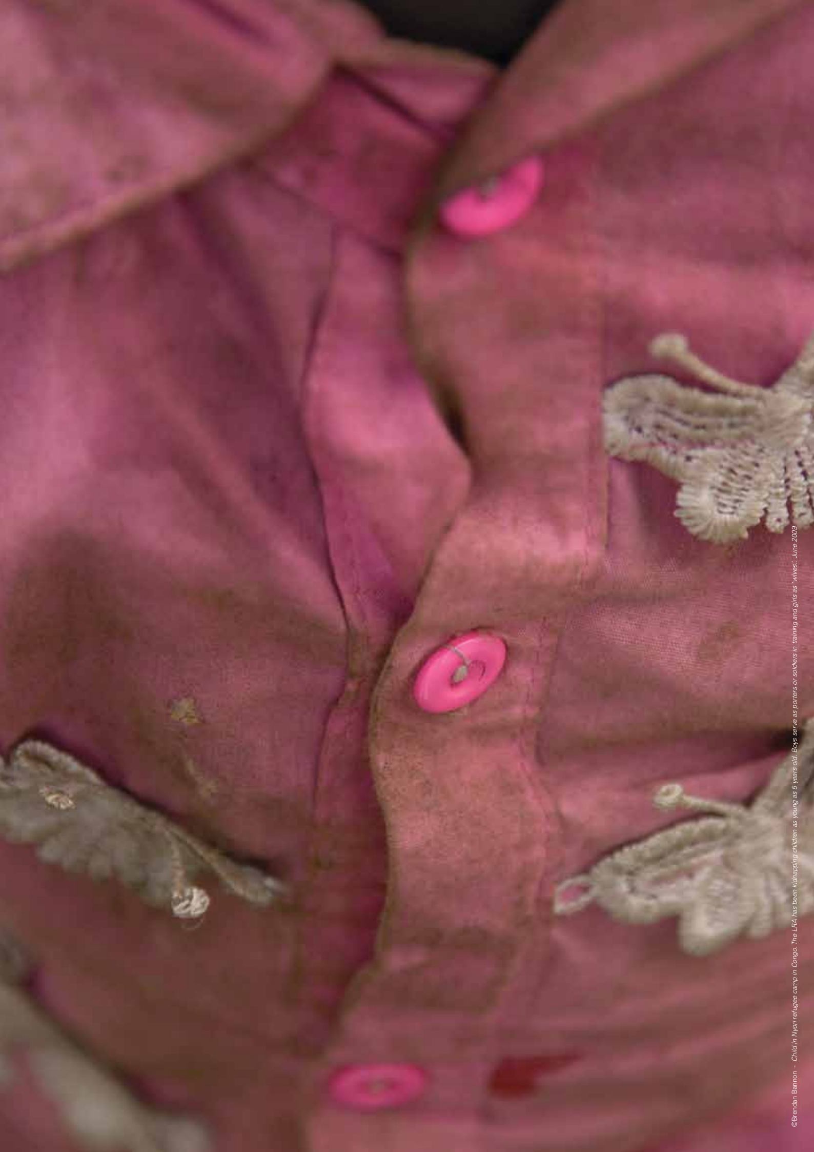
Child in Nyorti refugee camp in Congo. The LRA has been kidnapping children as young as 5 years old. Boys serve as porters or soldiers in training and girls as 'wives'. June 2009